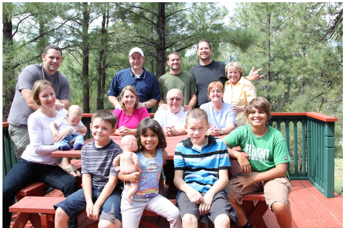
Participants in the Heber Project with Game & Fish