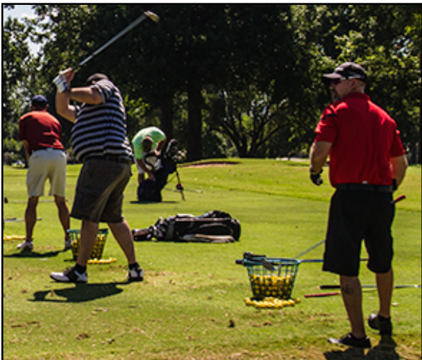
2015 ROTARY CLUB GOLF TOURNAMENT