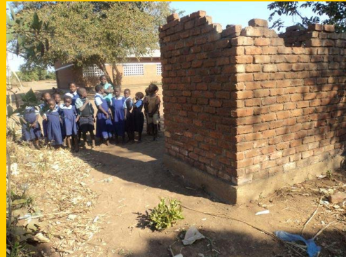
Students at the Mpachika Full Primary School in Malawi

Hookworm infestations, caused by these things, threaten the long-term development of one in three school-aged children. We can change the course of these children's lives, allowing them to focus on an education rather than collecting unsafe water and healing from illness.