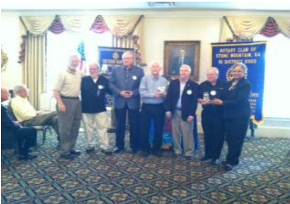
Rule of 85 Presenters - Click on picture above to view more pictures