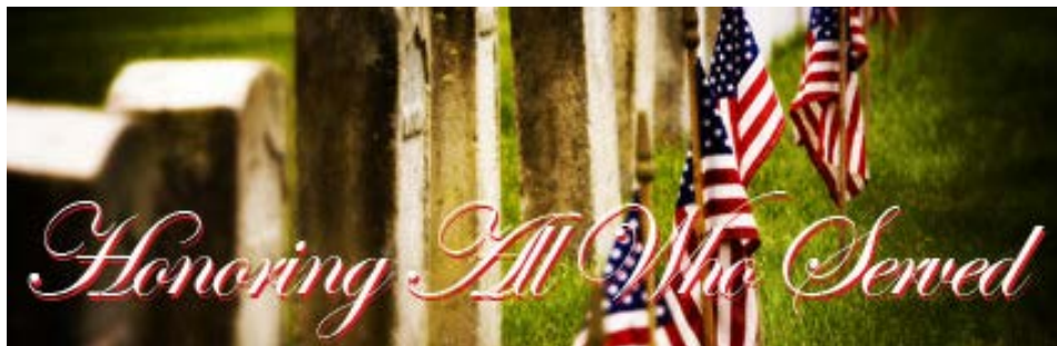
"Annual Memorial Day Commemoration Lunch"