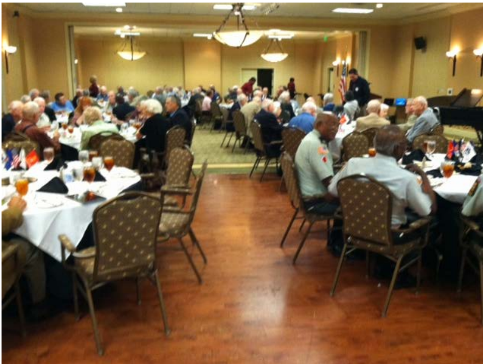
Veterans and Rotarians at Memorial Luncheon at Park Springs

In order to reach out and connect to as many veterans as possible, the DOD has enlisted the help of communities, organizations, companies, military units, cities, towns and states. Across the country, they now have over 5,500 commemorative partners and each are connecting with their veterans and helping the DOD thank them all. The Department of Defense's goal is to reach 15,000. Joining as a commemorative partner can be done on-line. It's free and only costs the time it takes to recognize veterans.