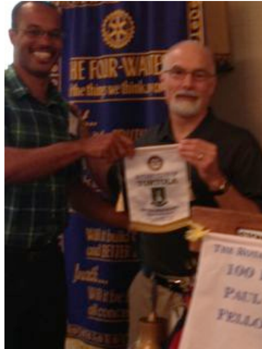
A visiting Rotarian from Tortola, part of the British Virgin Islands, submits a Tortola Rotary Banner as a gift to Rotary Club of Stone Mountain.