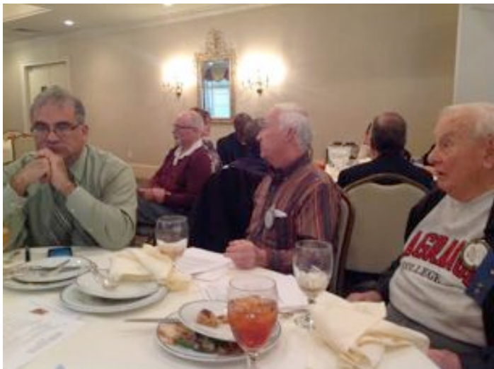
Rotarians listen attentively