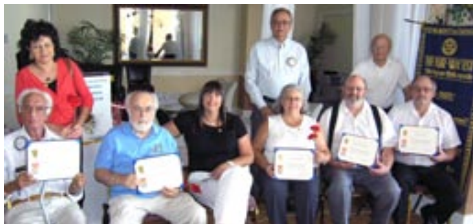
Newly named Paul Harris Fellows from the Ft. Lauderdale Beach RC.