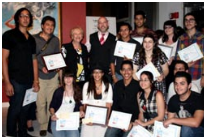
Winning art students for Miami Dade College show their certificates.