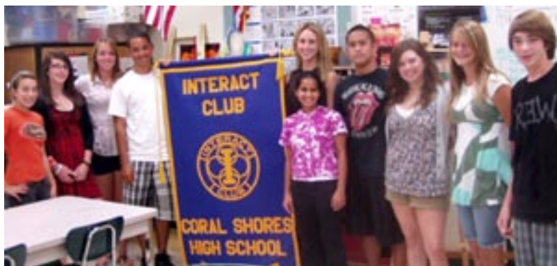
Coral Shores High School Interact poses during a meeting