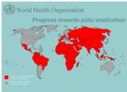
Above the WHO map of Polio endemic countries in 1988

"As a reporter, I've loved telling your story," she professed. "I'm hooked."