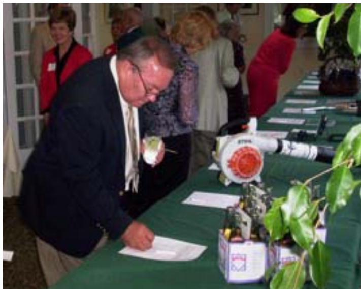
A BIDDER RUSHED TO ENTER A HOPEFULLY WINNING BID IN THE SILENT AUCTION AT THE CAPINNE CHARITY DINNER & AUCTION.

Plans are underway for CAPINNE 2010 with a goal of pushing the total assistance provided by the event over the half-million-dollar mark.