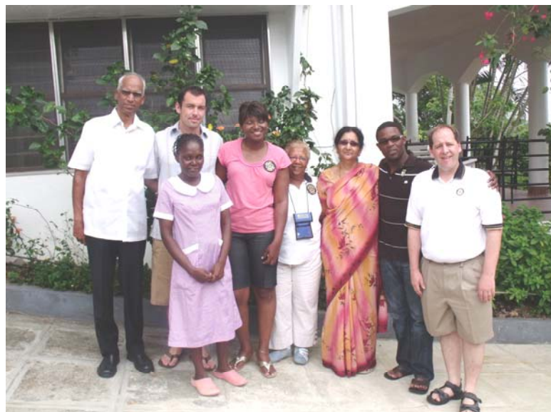
GSE TEAM 2

Potential projects. Of course there were countless other potential projects that we look forward to sharing with District 7610 Rotarians. Most importantly, what we gained in Jamaica was an extended family network that stretched over the 4,400-plus square miles of this Caribbean treasure. As we enjoyed fabulous house parties in our honor and joined Jamaicans at an annual Crab Fest to support