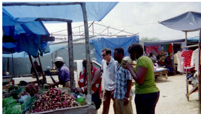
GSE TEAM 1

Forging friendships. From December 2009 to April 2010, GSE Team Virginia—which also