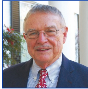
UNITED WAY CAMPAIGN