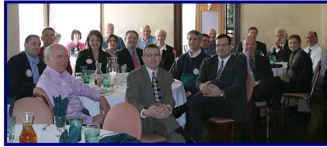
Rotary Club Meeting March 20, 2007

4. Leadership Development: Rotary is an organization of leaders and successful people. Serving in Rotary positions is like a college education. Leadership: - learning how to motivate, influence, and lead leaders.