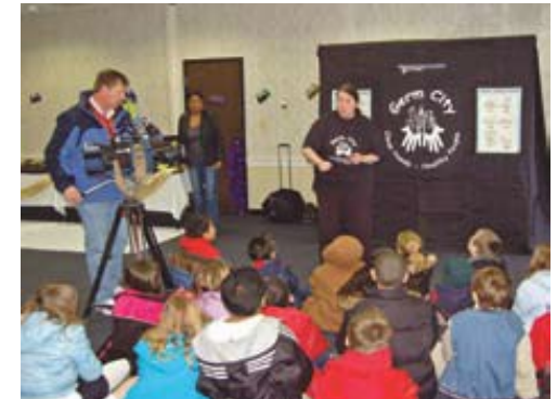
WAVE 3 TV came on site to televise the national prize-winning "Germ City" exhibit