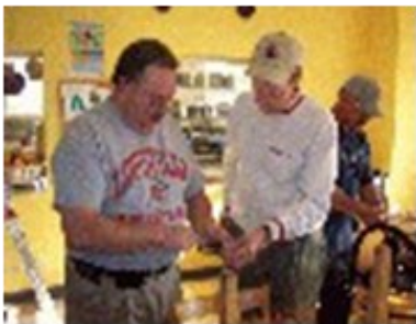
Working at Bellewood

We hope you will decide to make the time and financial commitments to join us in making a difference!